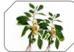
Withania somnifera (Ashwagandha)